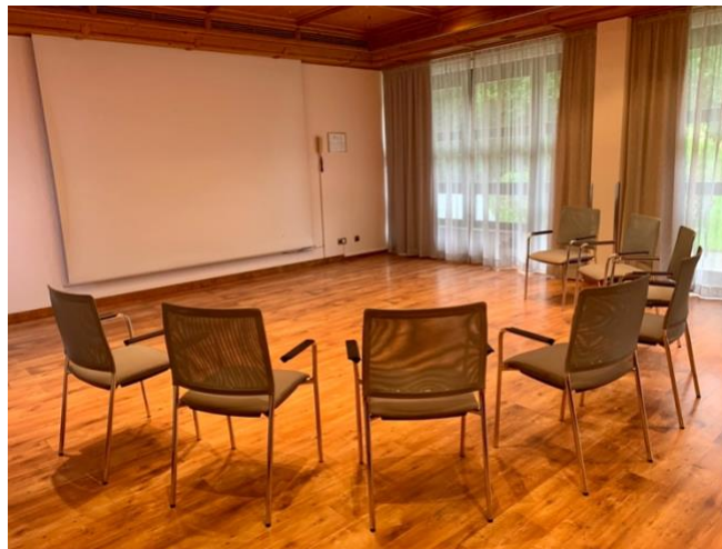
Circle of chairs